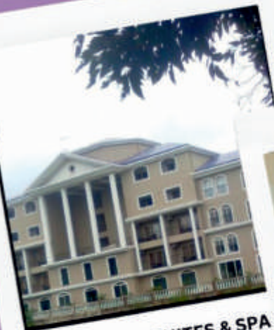
THE GOLDEN SUITES & SPA CALANGUTE