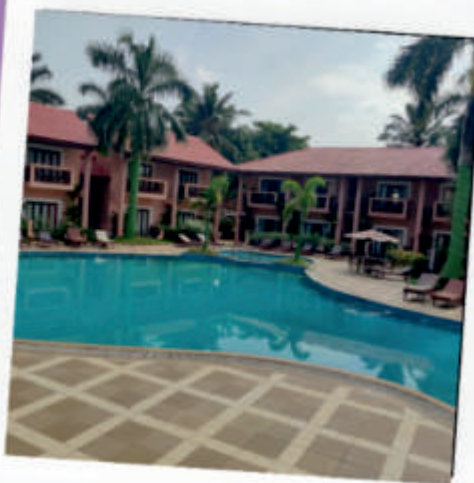
THE GOLDEN CROWN HOTEL & SPA COLVA